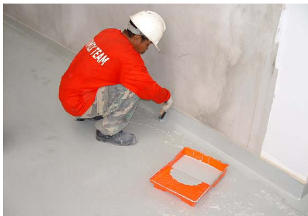
Detailing - Coves

Yellow / Grey / Light Grey 30.20 kg packs