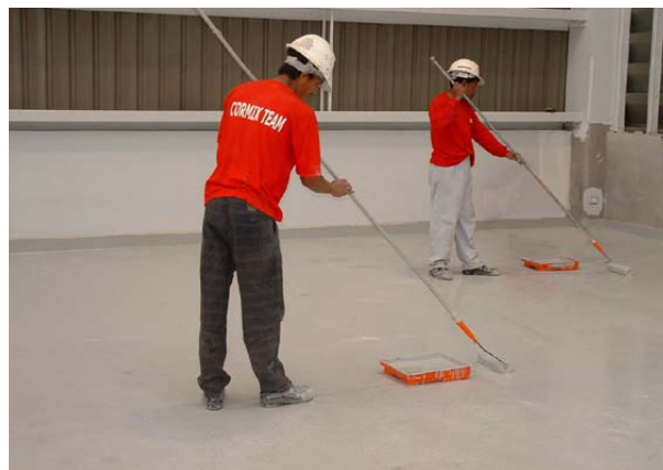
Application by Roller